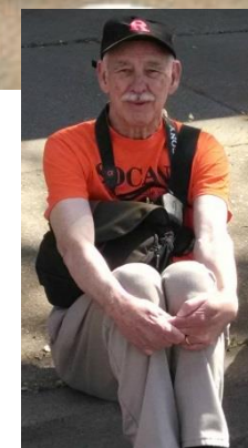
Pear Blossom Parade