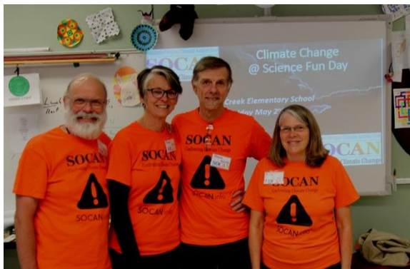
Griffin Creek School – Science is Fun Day